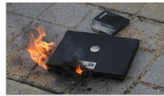
An old and obsolete PC